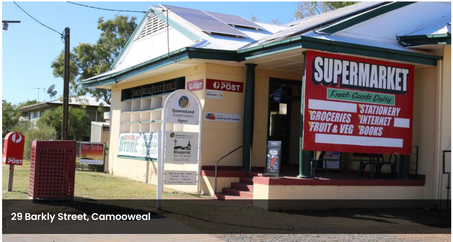
29 Barkly Street, Camooweal